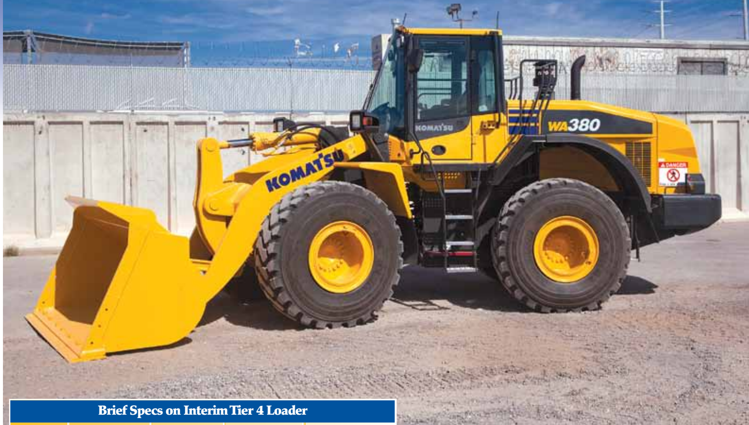
Brief Specs on Interim Tier 4 Loader