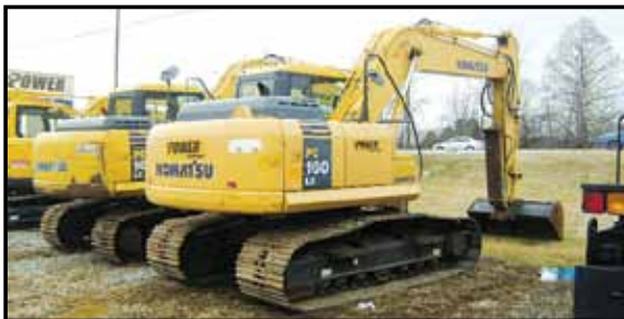
2007 Komatsu PC160LC7EO, PP25553, 1,350 hrs. $109,580