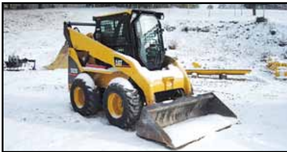
2005 CAT 262B, BCON3, 458 hrs. $28,500