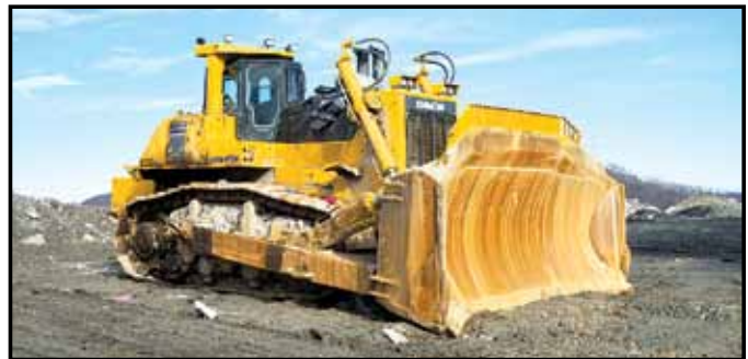
2003 Komatsu D475A-3, BPS0601, 20,574 hrs. $475,000