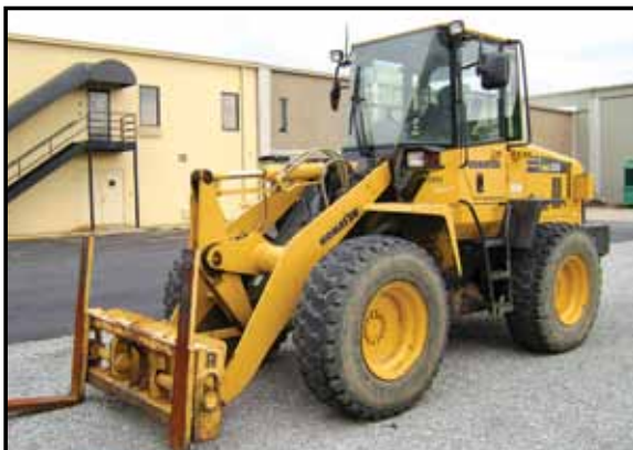
2007 Komatsu WA150-5, BTE0013, 7,784 hrs. $64,000