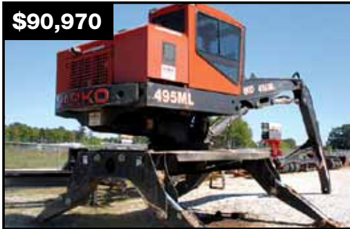
2008 Barko 495, PT25735, 4,371 hrs.