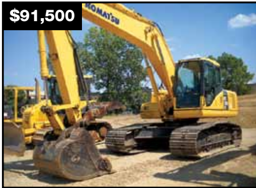
2002 Komatsu PC200LC7B, PT18719-1, 5,613 hrs.