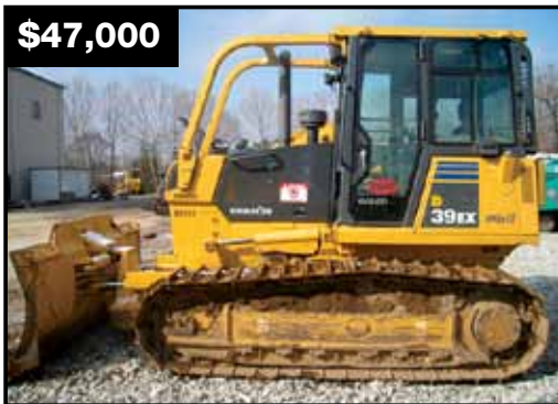
2006 Komatsu D39EX-21A, BCC1902, 2,049 hrs.