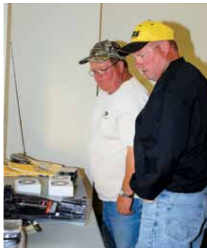
Tournament participants selected door prizes at the event dinner.