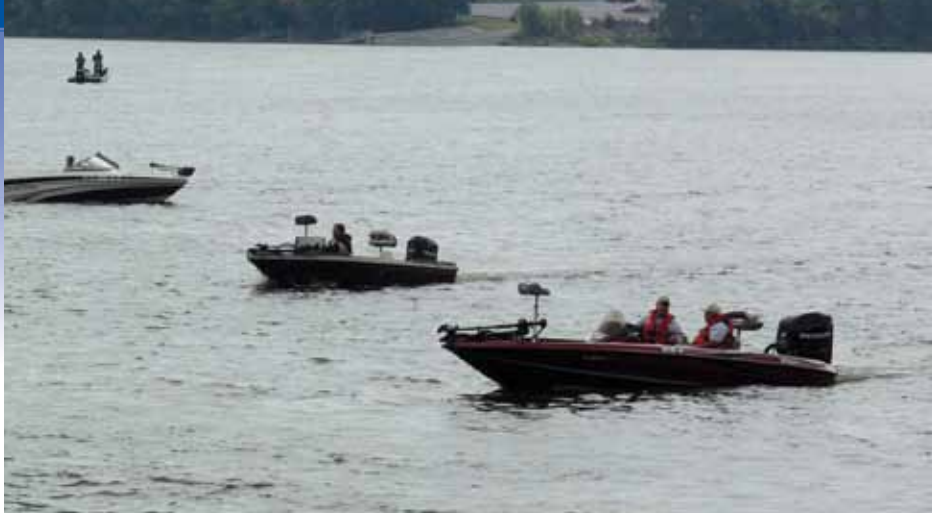
Boats dot the waters of Kentucky Lake as participants wait their turn for weigh-in.