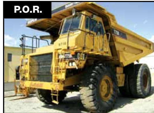
1995 CAT 775B, BTL1601, 25,246 hrs.