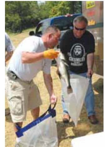
Participants transfer fish for weighing.