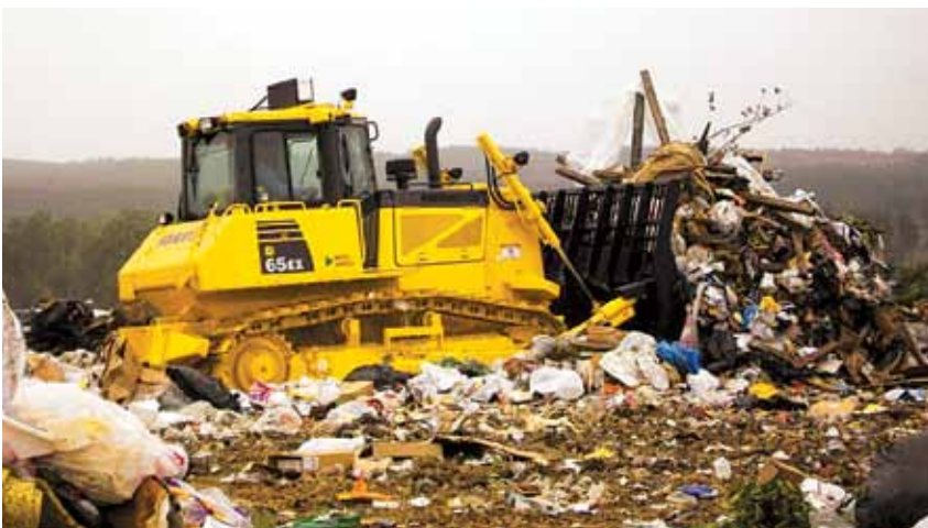
Komatsu's D65-17 waste-handler dozers are purpose-built with added guarding for working in tough conditions such as landfills. Blade options include SIGMA, power-angle-tilt and straight-tilt to match the user's need and maximize productivity.

"We know that many waste-handling operations work around the clock, so we kept the cab-mounted lights and moved the hood-mounted work lights to the top of the blade cylinders. Then, we placed an additional work light on each cylinder, for better night visibility," Boebel pointed out. "These productive features, when combined with our more efficient Tier 4 Interim engines, move more trash at a lower cost. We further reduced costs by offering complimentary scheduled maintenance through our Komatsu CARE program for the first three years or 2,000 hours, whichever comes first." ■