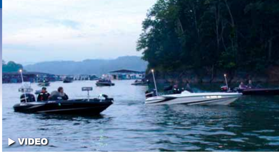
Fishermen wait for first light to head out on Douglas Lake.