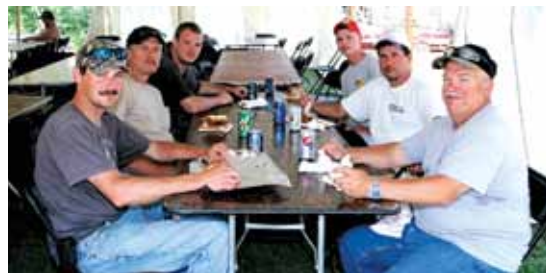
Premier Elkhorn teams enjoyed refreshments following a day on the lake.