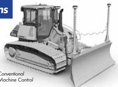
Conventional Machine Control