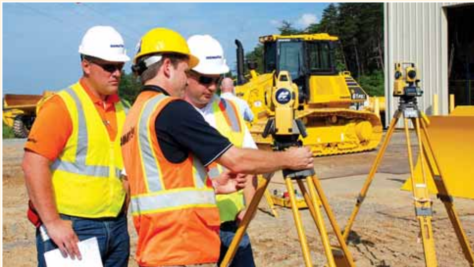
Komatsu distributors now have Technology Solutions Experts, whose role is to provide initial setup of the new D61i-23 dozers, along with ongoing support. They've spent many hours training to ensure customers' technology needs are met.

"From that point, the D61i dozers work much like traditional dozers, communicating with the user's own machine control base unit and design files," said Salyers. "The TSEs can help with these steps, too, by working with operators to dial-in the project, select proper modes based on site and material conditions and maximize productivity and fuel economy. They can also support traditional machine technology." ■