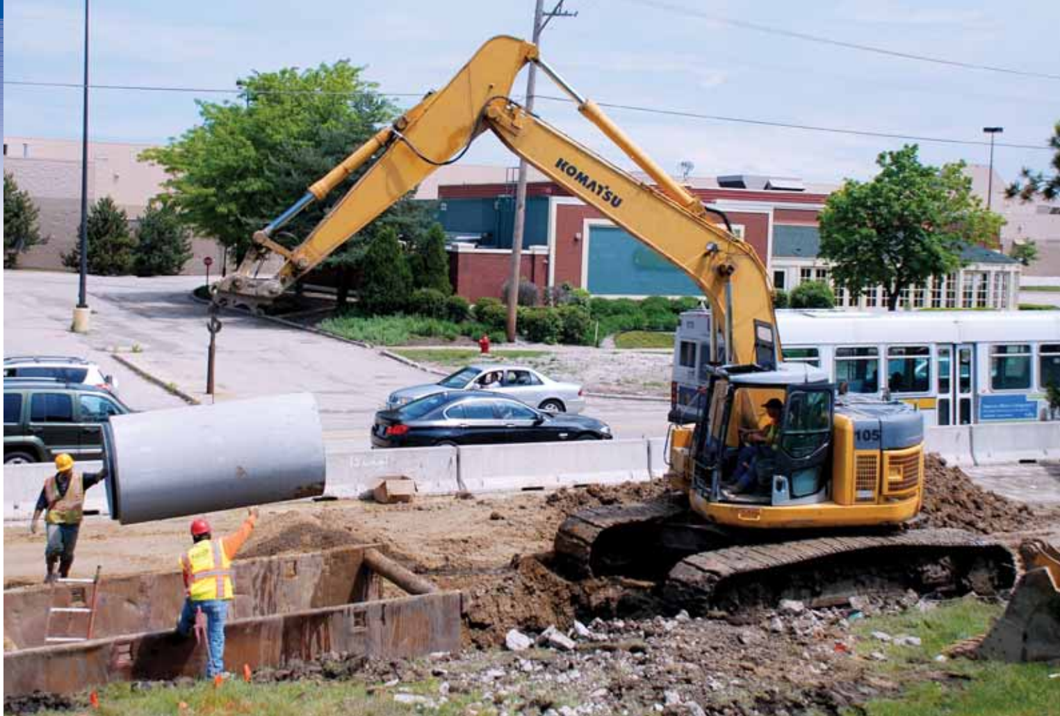
Figuring operating costs can be challenging because a particular machine may perform multiple tasks, such as an excavator that's used to dig and set pipe. Contractors must consider how each application affects production and fuel usage, and use other critical information to better calculate accurate operating costs.

of conditions and information on how operators and machines have worked and been used under similar circumstances provide a solid reference point.