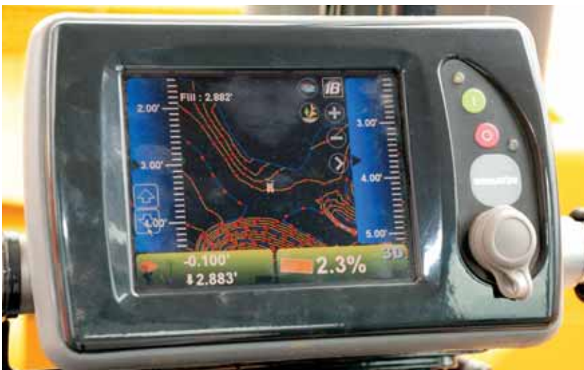
The integrated intelligent Machine Control system features stroke-sensing cylinders and a cab-top antenna that eliminate the traditional mast(s) and cables associated with 3D machine control. Operators can also select modes to match material conditions.

"We're reducing or eliminating those issues with the D61i," he added. "During rough cut, if