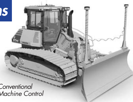
Conventional Machine Control