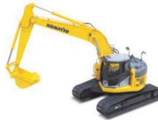
KOMATSU Excavators: PC35 - PC1250

D OWNTIME - Is kept to a minimum because it is monitored in real time using Komtrax telematics for usage, fuel consumption, idle time and malfunctions.