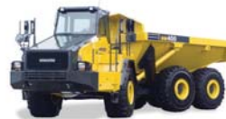
KOMATSU HM300 and HM400 Articulated Trucks