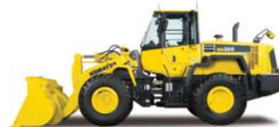
KOMATSU WA200 - WA500 WHEEL LOADERS