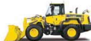
KOMATSU WA200 - WA500 WHEEL LOADERS