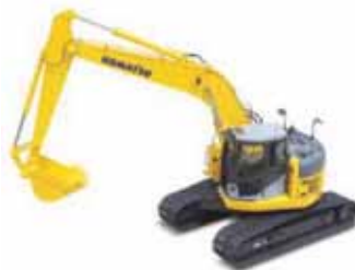
KOMATSU Excavators: PC35 - PC1250

*Offer applies to one machine for up to a one-year term.