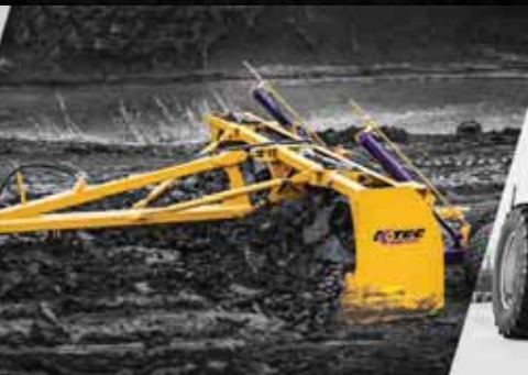
Flex Land Levelers