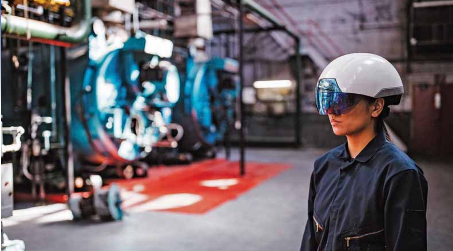
The smart helmet is a type of wearable technology that could become common on jobsites. One company, DAQRI, designed a wearable with a processor for multimedia and augmented reality. Its heads-up visor display allows instructions and jobsite models to be superimposed in their real-world environment, allowing the wearer to see how a future finished project will look upon completion.

environmental conditions provides a more immediate response to safety issues.