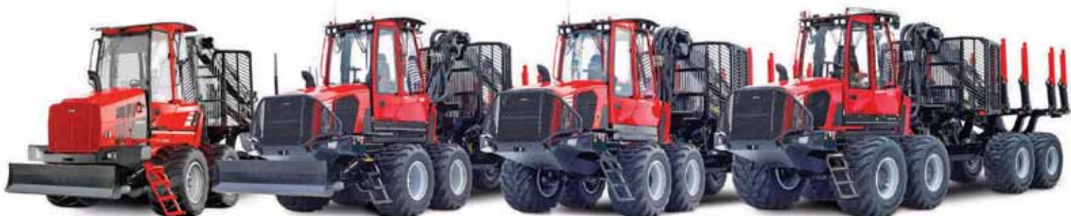
The new Komatsu 845, 855, 875 and 895 Tier 4 Final forwarders have rated payload capacities of 12, 14, 16 and 20 metric tons, respectively.