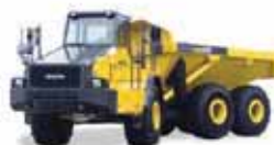
KOMATSU HM300 and HM400 Articulated Trucks