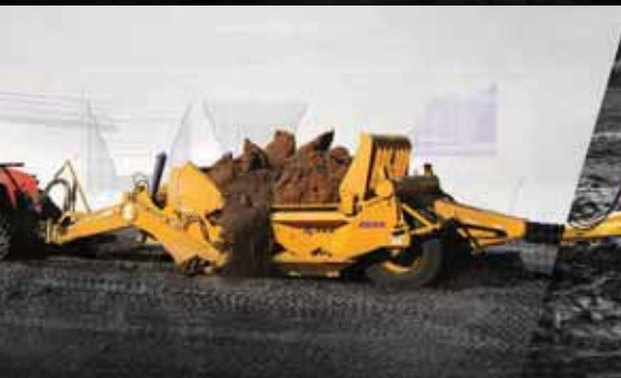
Direct Mount Scrapers

K-Tec Earthmovers builds industry leading scrapers and accessories for construction and mining sites around the world. At K-Tec™ we ensure you get the best return for your investment. Use our cost analysis tool to see for yourself at ktec.com . Gain a Massive Advantage by incorporating K-Tec™ equipment on your jobsite.