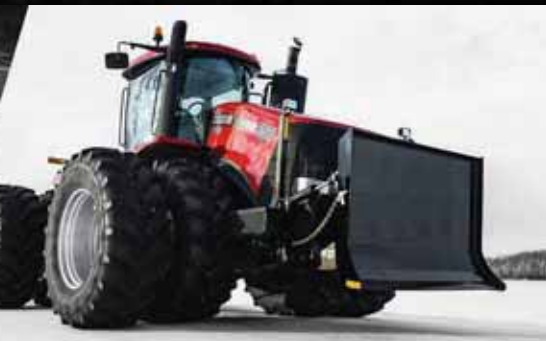
Ox Block Pusher Accessory